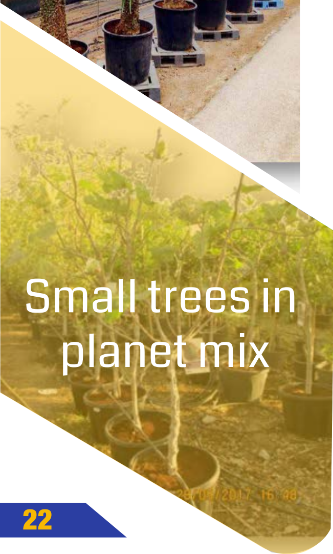
Small trees in planet mix