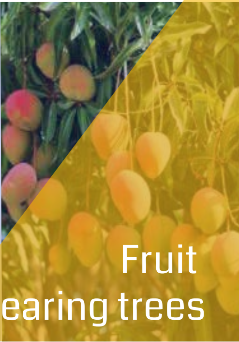
Fruit bearing trees