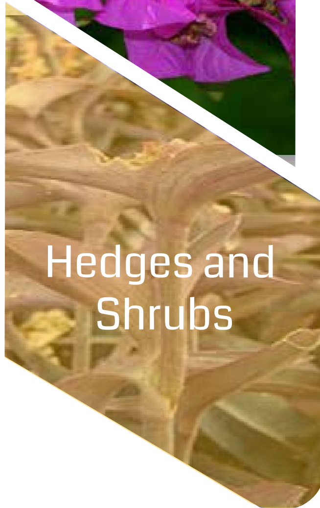
Hedges and Shrubs