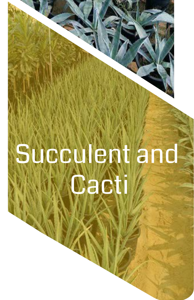
Succulent and Cacti